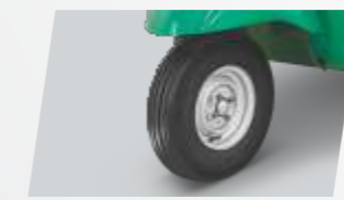
Tubeless Tyres First in 3 Wheeler Segment