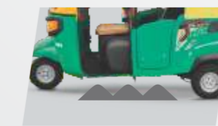
Higher Ground Clearance