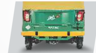
Stylish Rear Bumper