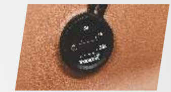
Dual Port USB Fast Charger