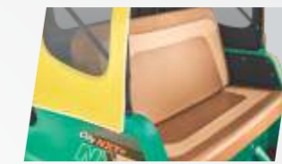
Dual Tone Seats