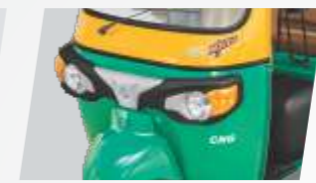
Stylish Front Fascia