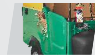
Passenger Safety Door