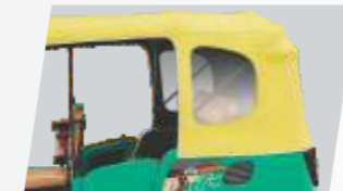
Stylish Hood with Bigger & Transparent Window